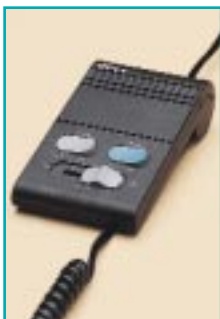
The MPA-II Multi-Purpose Amplifier works on most phone systems with a modular handset connector. The easiest amplifier to set up and use, it features a sliding volume control, headset/handset switch, mute switch and a built-in headset stand. An optional on-line indicator signals when the headset is in use.

There's a GN Netcom amplifier for every need and every application. Like our headsets, all GN Netcom amplifiers feature a two-year warranty.