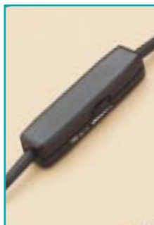
Our 0686 In-line Amplifiers provide a cost-effective option for standard carbon applications. Incredibly compact, they feature a rotary wheel for a broad range of volume adjustments. Also available with a mute button, 0686M .