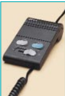
The MPA-II Multi-Purpose Amplifier works on most phone systems with a modular handset connector. The easiest amplifier to set up and use, it features a sliding volume control, headset/handset switch, mute switch and a built-in headset stand. An optional on-line indicator signals when the headset is in use.

There's a GN Netcom amplifier for every need and every application. Like our headsets, all GN Netcom amplifiers feature a two-year warranty.