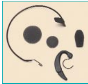
The Stratus Ultra-G comes complete with headband, ear capsule, ear cushions and windscreens.

There's a GN Netcom amplifier for every need and every application. Like our headsets, all GN Netcom amplifiers feature a two-year warranty.