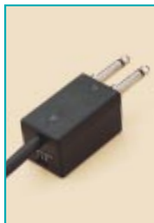
The 0452 Two-Prong Amplifier is designed for telephones equipped with a two-prong headset port. Its 3-position volume control locks your volume preference in place.

Also available: The 0911 Two-Prong 6-Wire Amplifier, for push-to-talk dispatch/911 environments; and the HT One Headset Telephone (HT-1), the first professional-quality telephone with an integrated headset—ideal for PBX and CTI applications.