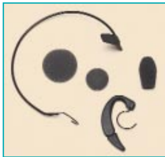
The Stratus Ultra-G comes complete with headband, ear capsule, ear cushions and windscreens.

There's a GN Netcom amplifier for every need and every application. Like our headsets, all GN Netcom amplifiers feature a two-year warranty.