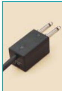
The 0452 Two-Prong Amplifier is designed for telephones equipped with a two-prong headset port. Its 3-position volume control locks your volume preference in place.

Also available: The 0911 Two-Prong 6-Wire Amplifier, for push-to-talk dispatch/911 environments; and the HT One Headset Telephone (HT-1), the first professional-quality telephone with an integrated headset—ideal for PBX and CTI applications.