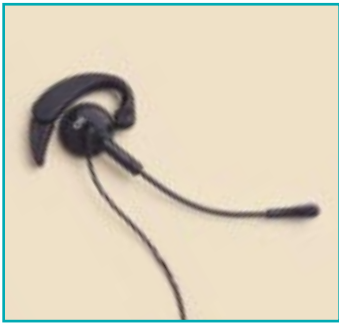
Stratus Ultra ST-I

The Stratus Ultra-G convertible headset lets you choose either our Adjustable Lobe Hinge for confident on-the-ear comfort, or a slender headband, for over-the-ear stability. And its noise-canceling microphone delivers uninterrupted call clarity.